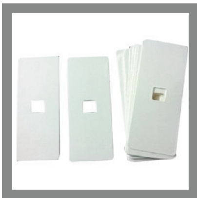
Sakura Cytotec Filter Card Size: 26 x 64mm 1 SQUARE HOLE.