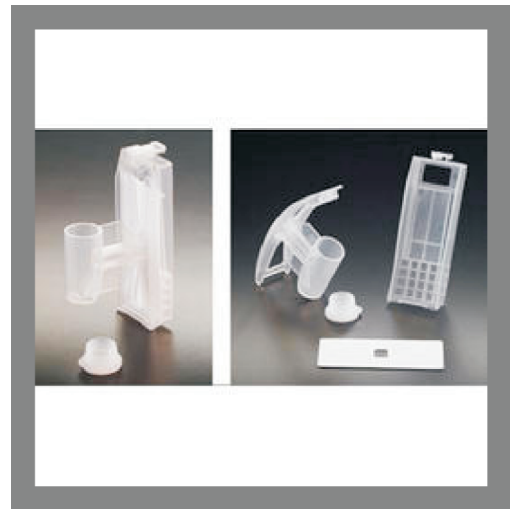
Sakura Cytotec Funnel