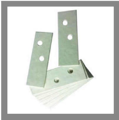
Double Funnel Filter Card

Single Use | 200 Card Per box Purpose : Absorption | White Colour