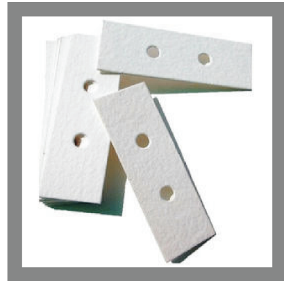
Cytospin Filter Card Size: 25 x 75mm 2 round Centered holes